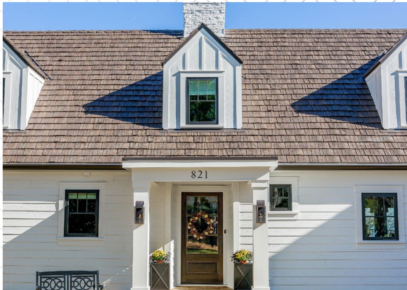
Brava Cedar Shake Lake Forest

Brava uses state-of-the-art compression molding technology, making it the strongest shake available. It's this attention to detail that makes Brava stand above the competition.