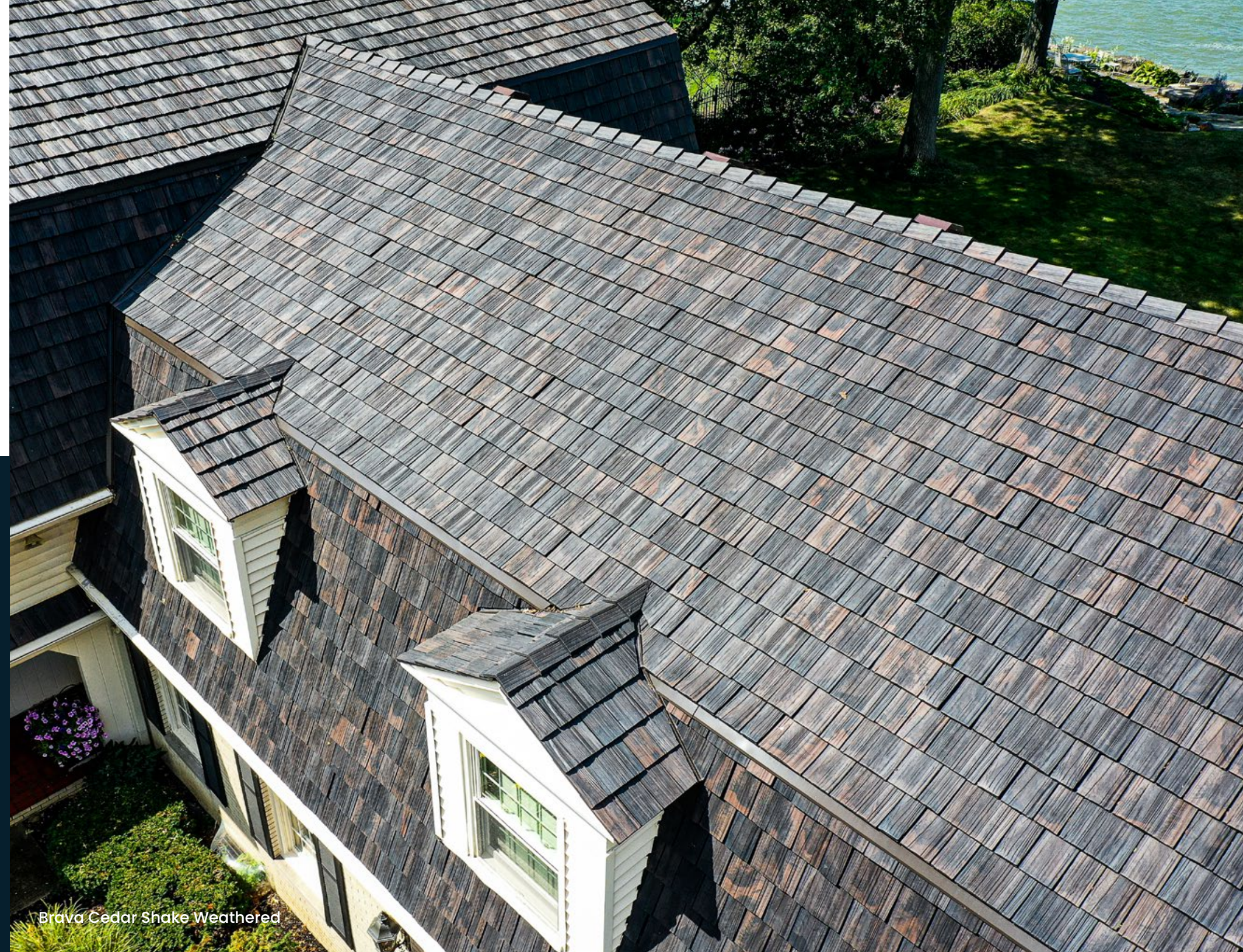
Brava Cedar Shake Weathered