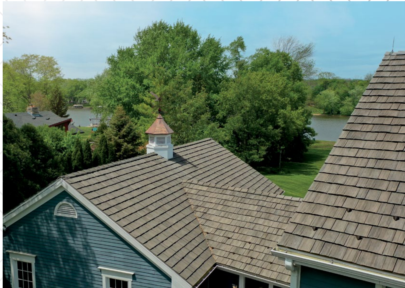
Brava Cedar Shake Lake Forest

Brava shakes are crafted with a blend of high-grade, high-spec pre-consumer recycled plastic, natural minerals, and binders.