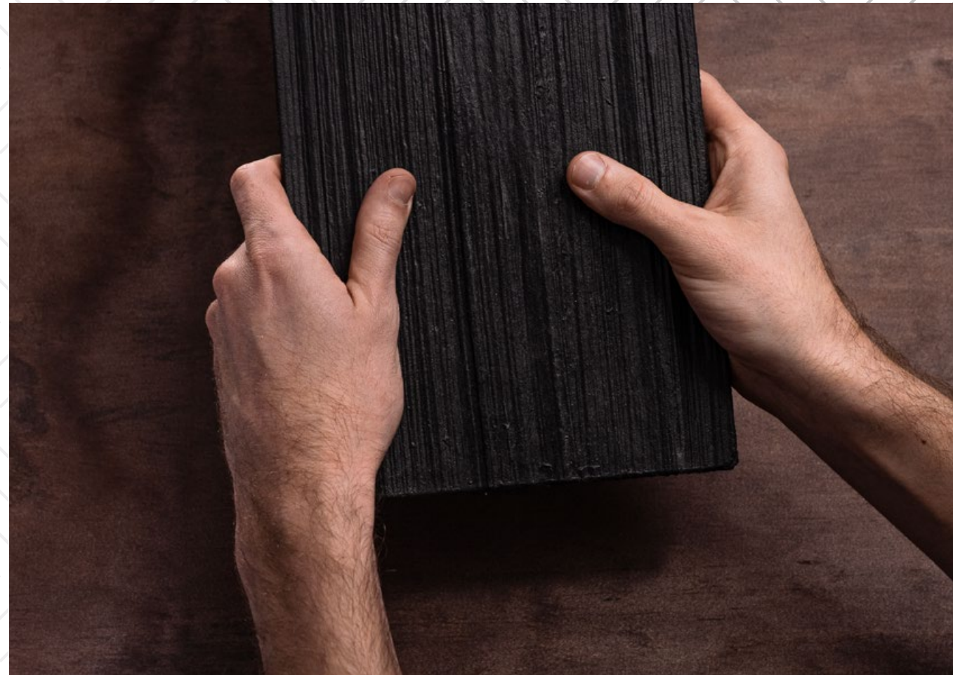
Brava Cedar Shake Arendale

Once you see it for yourself, you'll understand the combination of artistry and technology that goes into every Brava shake. There is no comparison.