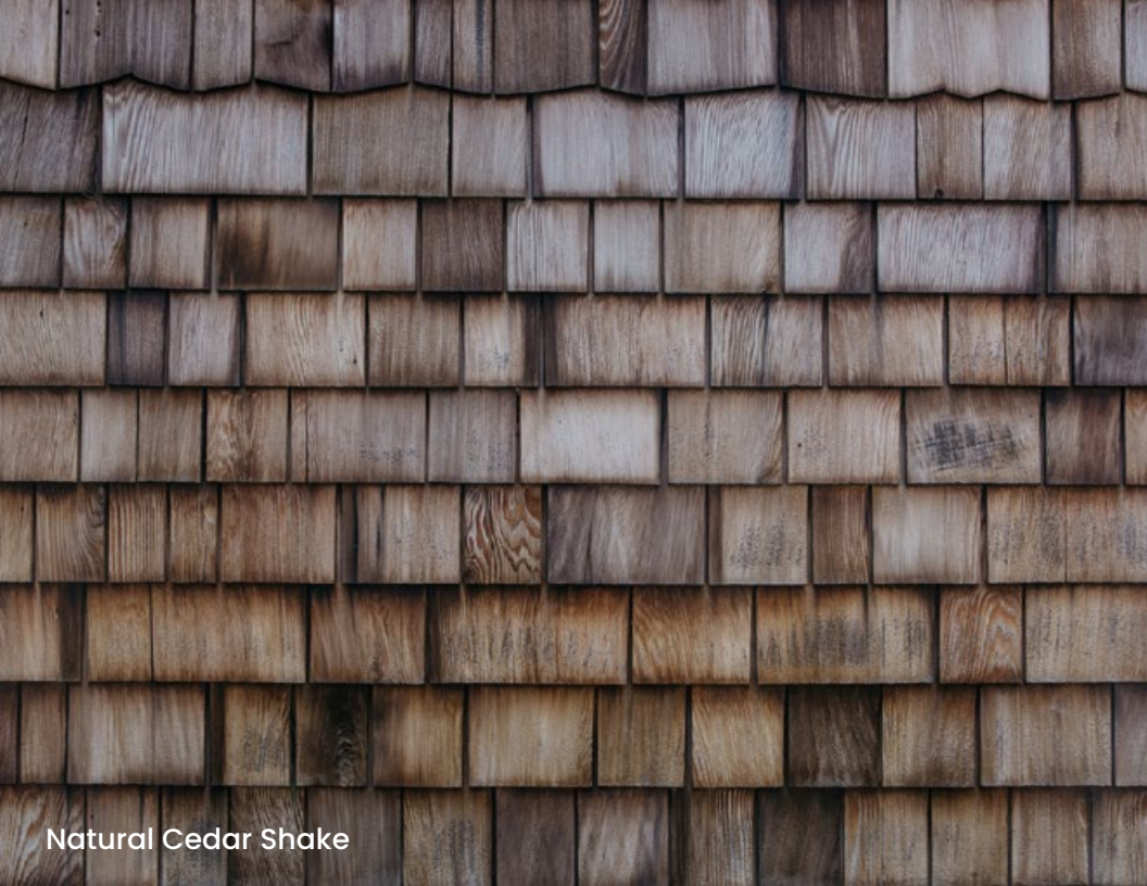
Natural Cedar Shake

The beauty of cedar shake: Not every shingle is alike.