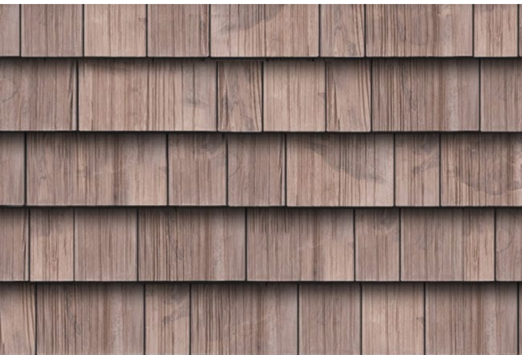
Brava Cedar Shake Sierra

The beauty of Brava Roof Tile: Not every synthetic shake is alike.