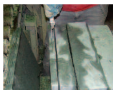
Greenstone slates are hand-split from cut blocks of stone

Beautiful slates can easily be supplied from a vast array of international sources. However, it must be stressed that not all slates are created equal. Without longevity, the benefits of a slate roof are lost. Securing a durable slate is not a simple choice but Greenstone can ease this challenge. From our 58 quarries, in what is noted around the world as the Slate Valley of Vermont, we provide the complete range of Vermont colors, blends and textures. Since 1955 our stone has been worked exclusively by Greenstone trained craftsmen. Our production facilities combine time-proven traditional techniques with the latest manufacturing technologies and our quality control is second to none.