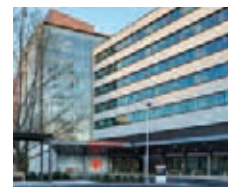
Greenstone Slate cladding: Seattle Children's Hospital

of the natural product. These strategic partnerships have enabled us to provide reduced weight slate roofs with proven durability, and new benefits including: